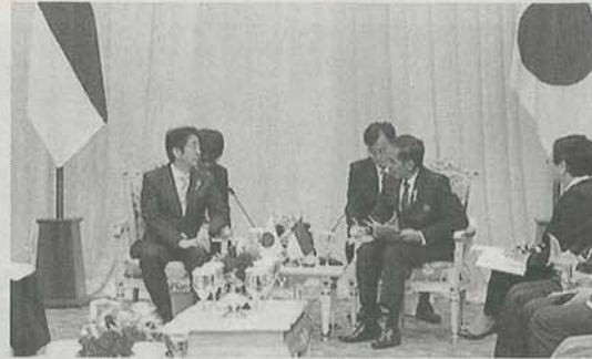
Indonesian President Joko "Jokowi" Widodo (second from right) and Prime Minister Shinzo Abe meet on April 22 in Jakarta on the sideline of the 60th commemorative Summit of the Asia Africa Conference.

Prime Minister Shinzo Abe also paid a visit to Jakarta from April 21 to 23 to attend the 60th commemorative Summit of the Asia Africa Conference. Japan has also been very active in sending high-level economic missions to Indonesia such as Keidanren, the Japan