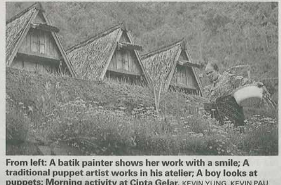
From left: A batik painter shows her work with a smile; A traditional puppet artist works in his atelier; A boy looks at puppets; Morning activity at Cipta Gelar.